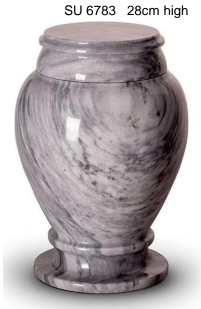
SU 6783 28cm high