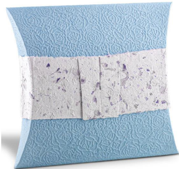
Water Journey Urn ZU 002 35cm high