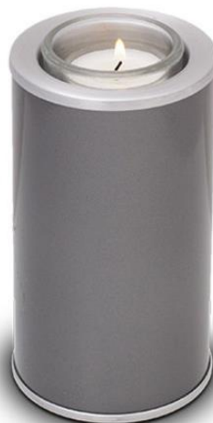
CHK 109 15cm high