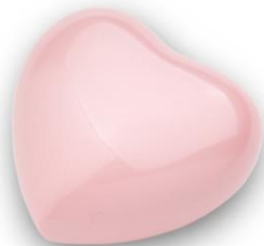
HUH 409 7cm high