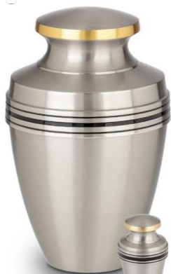
HU 182 K 8cm high