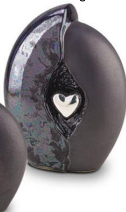
KU 010 S 17cm high