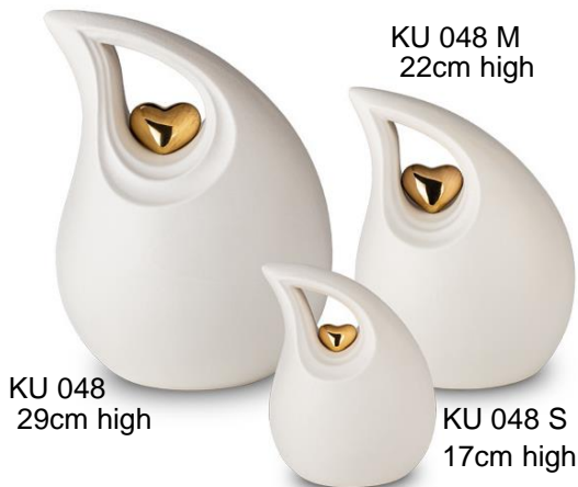
KU 048 29cm high