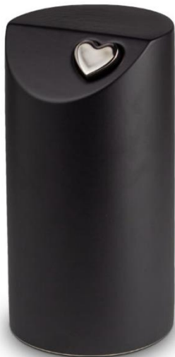
KU 106 32cm high