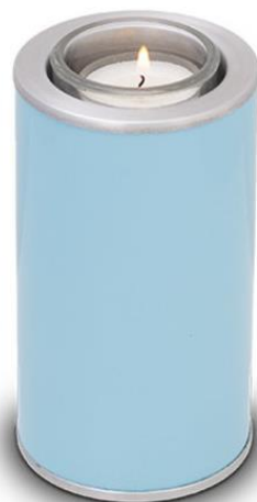
CHK 668 15cm high