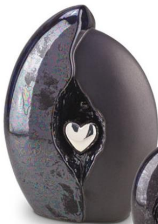
KU 010 29cm high