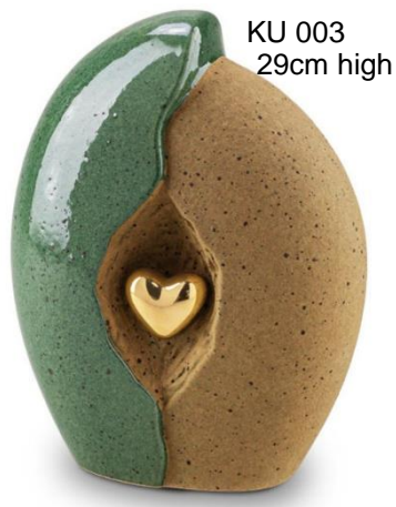
KU 003 29cm high